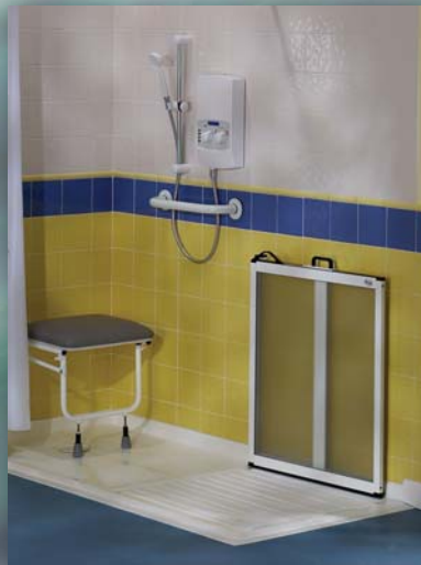
Sandwell MK3 655/760