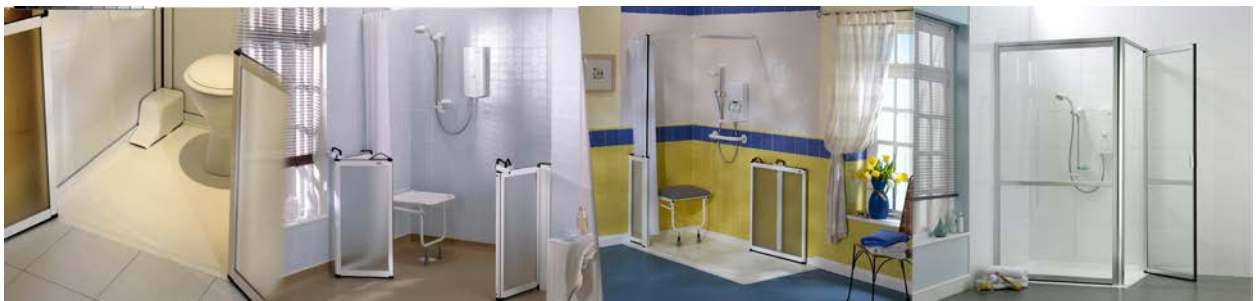
Shower WC cubicle