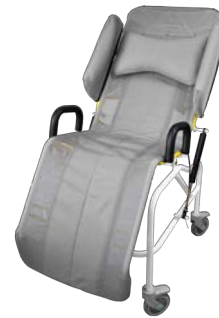
Washington Tilting Shower Cradle