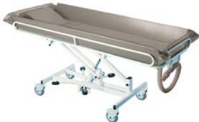
T1 shower trolley, now available in 20 colour options