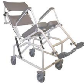
Aquamaster Tilt in Space Chair