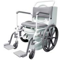
New AquaMaster Closomat Range