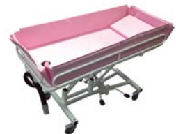
T3 Paediatric trolley - now available in 20 colour options