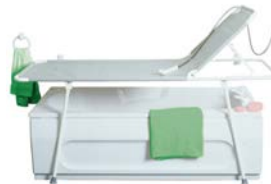
T12 fold up stretcher