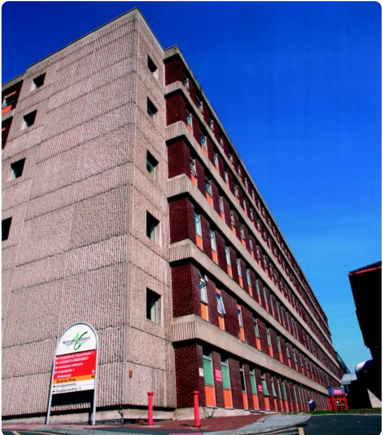
Northern General Hospital in Sheffield

T he Northern General Hospital in Sheffield is one of the country's fastest growing teaching hospitals, catering for many different needs. A major refurbishment project at the Huntsman No 1 Admissions Ward called for specialised patient handling equipment. Chiltern Invadex provided nine Wispa Ceiling Mounted Hoists as part of a £27,000 installation contract.