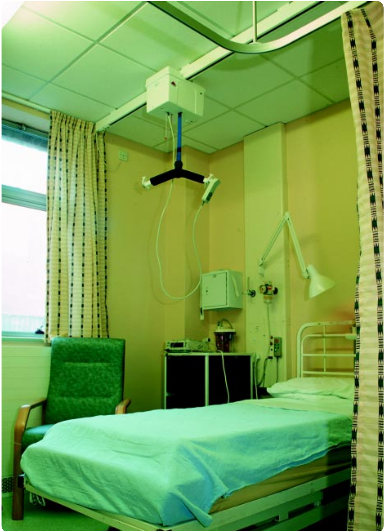
A Wispa hoist with standard hand control provides for moving and handling patients in one of four assisted bedrooms

Invadex, which included hoist tracking and patient handling sling demonstrations.