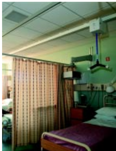
A single Wispa hoist services 6 beds

“The system has been a very important investment for the ward and is of huge benefit to both patients and staff”