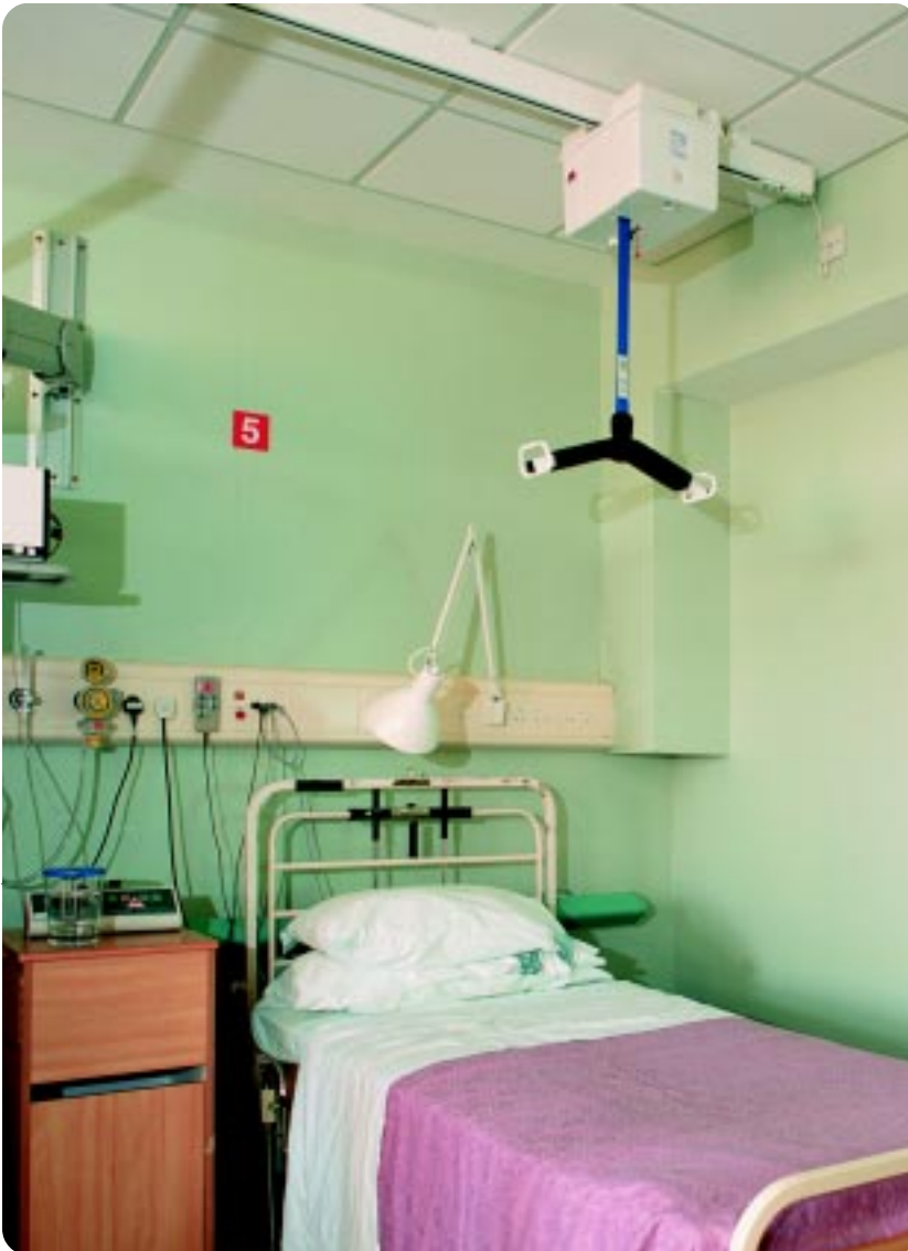
A Wispa hoist in the Admissions Ward equipped with Infra red controls