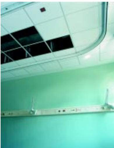
Part completed installation of the ceiling track in the Admissions Unit