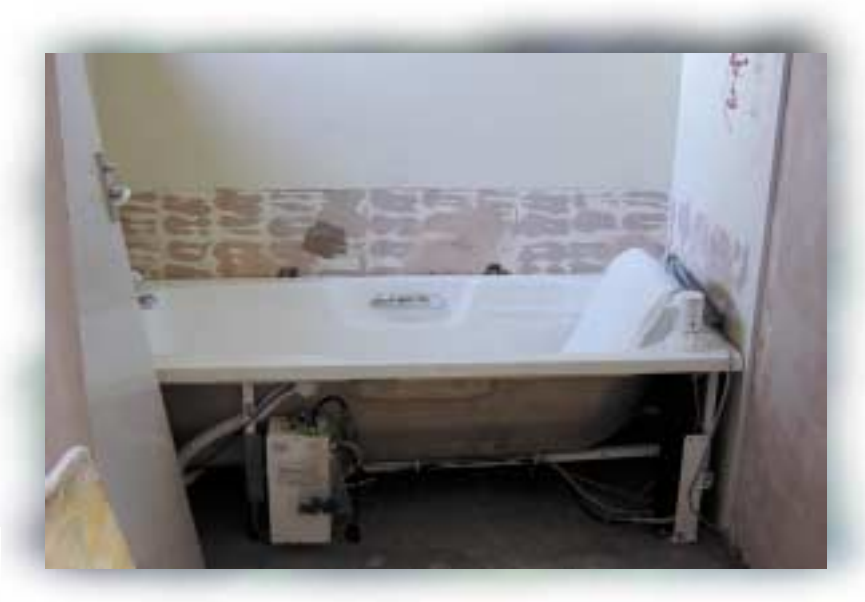
Part completed installation of the Concept 2000 bath with rotating seat

The installation of new facilities followed a demonstration at Willoughby House, whereby Chiltern Invadex agreed to erect and display its Slimline Side Entry Shower Cubicle for review by the schemes elderly residents. The product was extremely well received and residents voted overwhelmingly in favour of the proposed bathing adaptations.