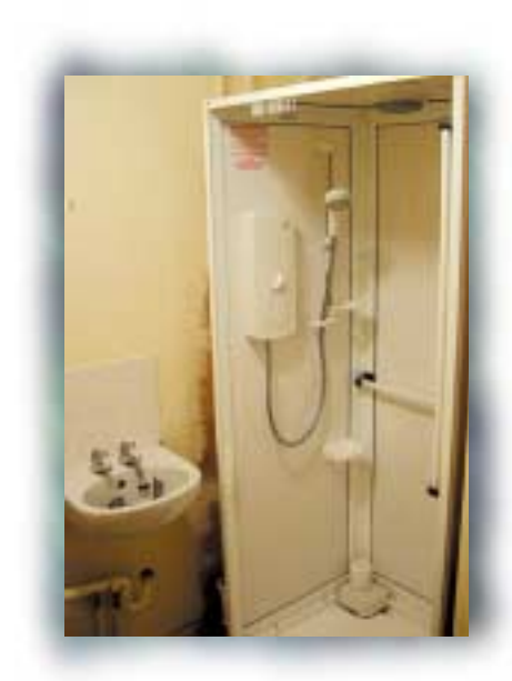
Part installed Slimline Side Entry shower cubicle

The new facilities are popular with residents as they can now shower themselves in the comfort and privacy of their own homes, and the design of the shower ensures all safety aspects are covered. Enhanced features include a textured floor surface; grab rails and a flat padded shower seat that can be fixed at any height to suit the user.