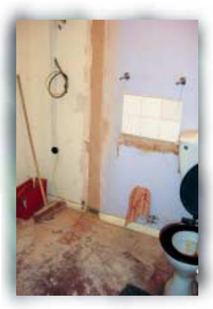
Removal of all fittings prior to installation

the smallest of spaces, took the place of a cupboard that was removed from each accommodation unit. It was easily and quickly fitted, removing the need for tiling or re-decorating. Minimal disruption allowed residents to continue living in their property whilst the bathing adaptations were being completed.