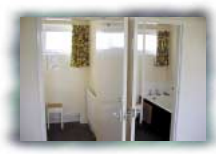
Communal bathing facilities prior to modification

The installation of new facilities followed a demonstration at Willoughby House, whereby Chiltern Invadex agreed to erect and display its Slimline Side Entry Shower Cubicle for review by the schemes elderly residents. The product was extremely well received and residents voted overwhelmingly in favour of the proposed bathing adaptations.